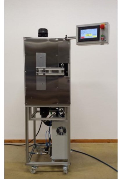
New design! Shows our demo oven. From now on it will be built like this but with four units like the oven on the picture to the left.