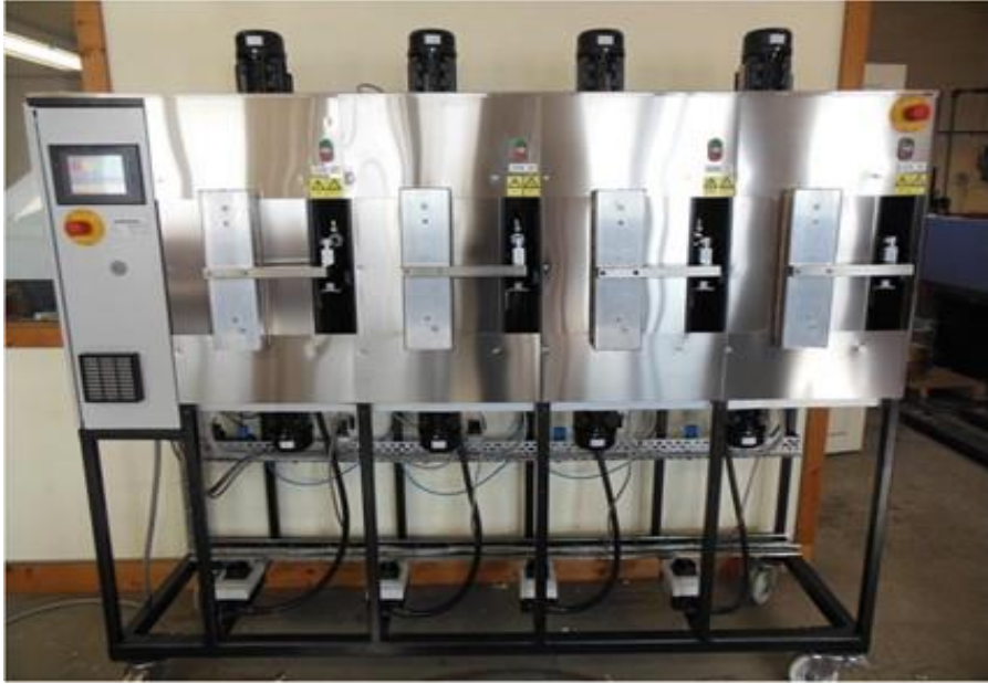
Unit with four separate ovens.